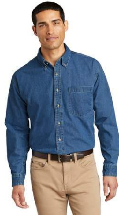
Port Authority Men's Denim Shirt

With a more substantial stonewashed fabric and extra-durable seams, this heavyweight denim shirt is built to embroider beautifully.