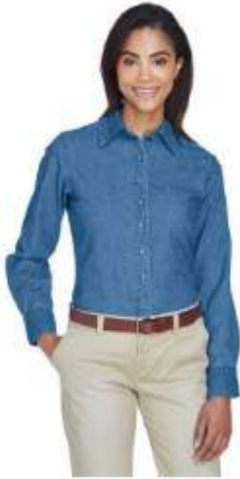
Harriton Women's Denim Shirt - $42 Sizes S – 3XL Style #M550W