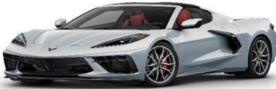
2024 Silver Flare Corvette Coupe Price $100.00 – 2000 Tickets Drawing December 7, 2023 – 2:00 PM Central Time