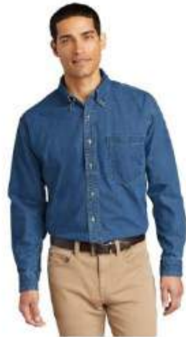
Port Authority Men's Denim Shirt - $45 Sizes S – 4XL Style #S100

Merchandise sales or pick up of items at monthly meetings start at 6 pm.