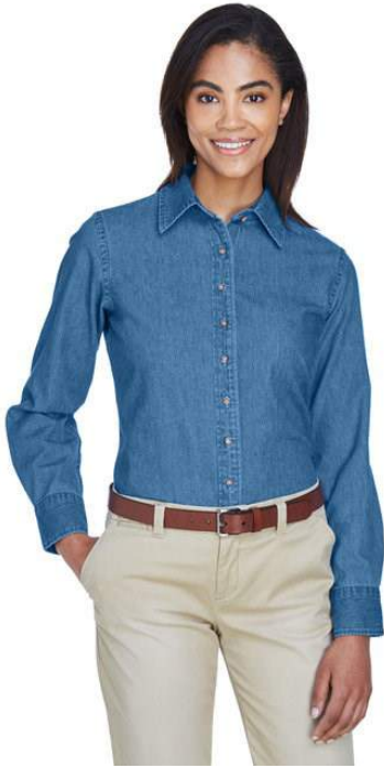
Harriton Women's Denim Shirt