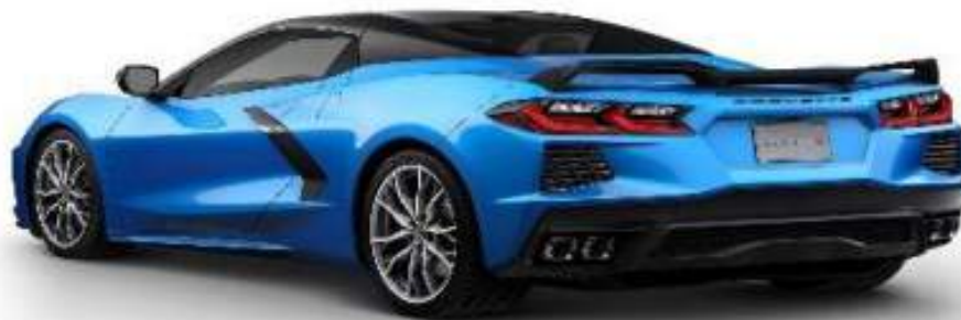
2024 Riptide Blue Corvette Convertible Price $175.00 – 2000 Tickets Drawing December 24, 2023 – 2:00 PM Central Time