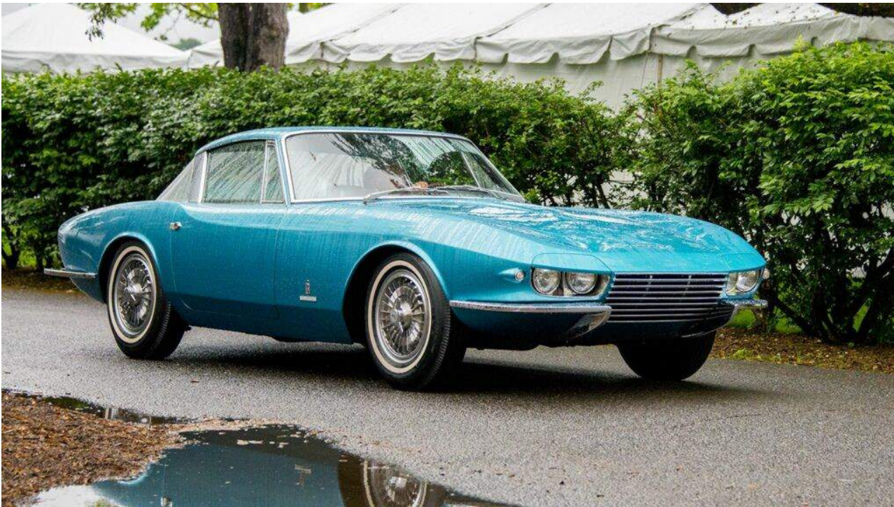
The 1963 Corvette Rondine.

Built by Italian coach builder Pininfarina on the chassis of a 1963 Corvette, the Corvette Rondine is part Ferrari, part Corvette, and all kinds of awesome! Commissioned by Chevrolet , the Corvette Rondine featured a number of identifiable Pininfarina design elements wrapped around the proportions of the factory Sting Ray. Although the car looks more Ferrari than Chevy, all of the car's underpinnings remained true to the second-generation Corvette, making this beauty a one-of-a-kind hybrid of Italian design and American muscle. This car actually lived in a museum from the time it was created until 2008, at which point it was purchased at auction by a private collector for a modest sum of just $1.6 million dollars!