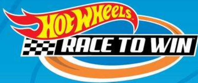
Exhibit opens May 27th