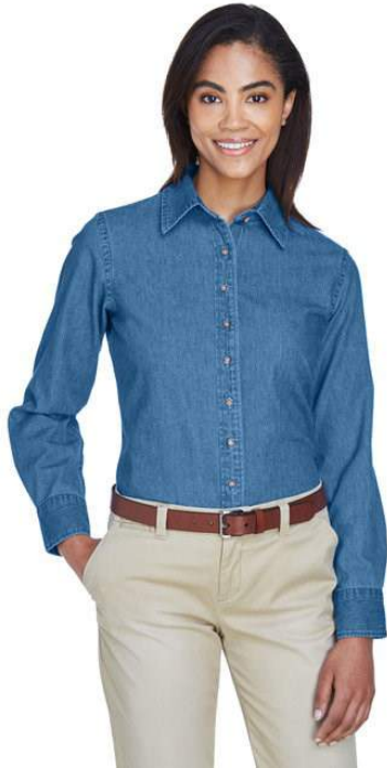
Harriton Women's Denim Shirt