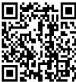
New England Caravan Website